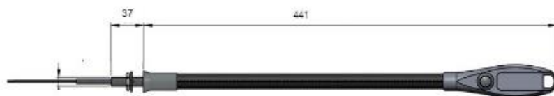
Light Dimensions in mm